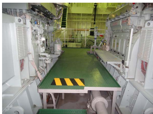
Auxiliary Engine Deck