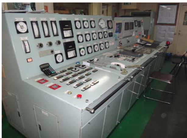
Engine Control Console